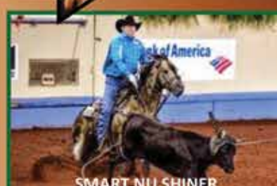
SMART NU SHINER

World Champion Heeling 460 Perf Pts & AQHA Champion