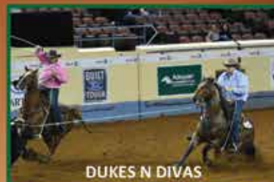
DUKES N DIVAS

Superior Heading & Heeling with over 200 Rope points