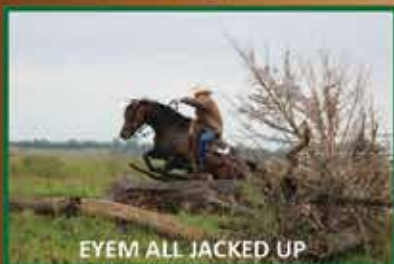
EYEM ALL JACKED UP

World Champion Heeling 460 Perf Pts & AQHA Champion