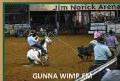
GUNNA WIMP EM

60 Roping & Halter Points And still showing