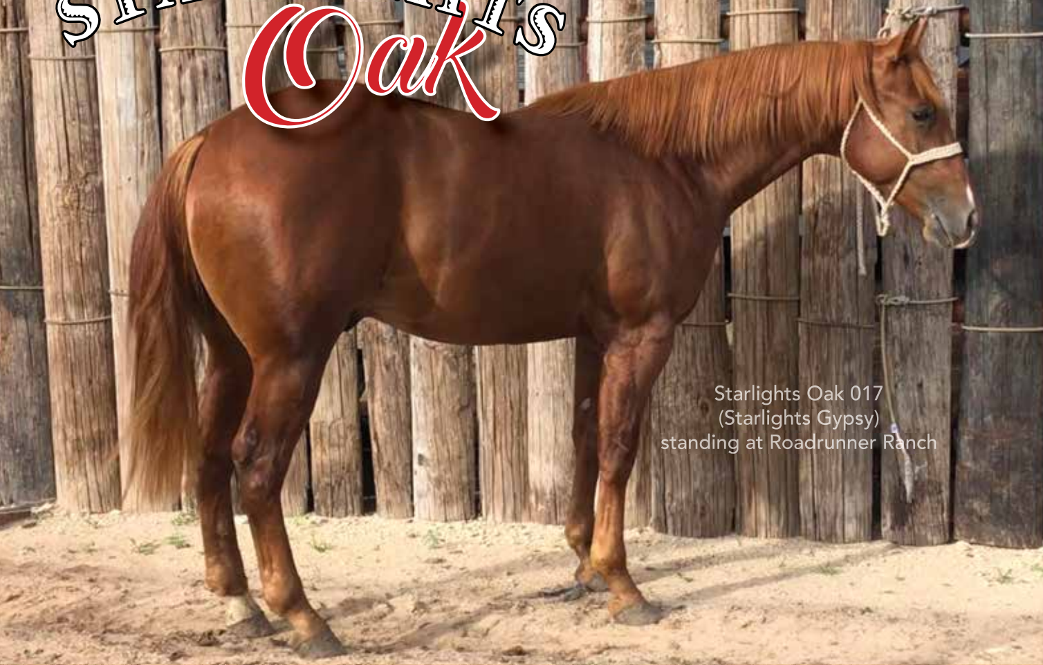
Starlights Oak 017 (Starlights Gypsy) standing at Roadrunner Ranch