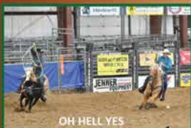
OH HELL YES

Superior Heading & Heeling with over 200 Rope points